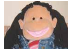
Puppets Wally and Molly from Incredible Years