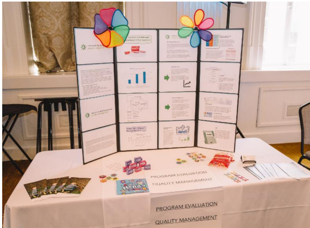
Morrison's Program Evaluation and Quality Management Depts highlight their findings.