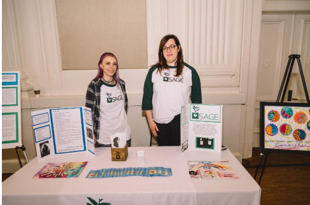
Morrison's SAGE Staff showcase their success stories.